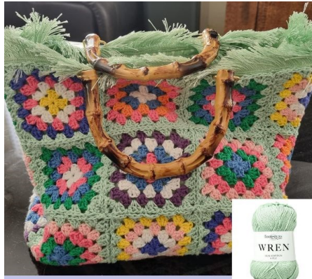
Granny Square Bag using Wren cotton SUSAN L