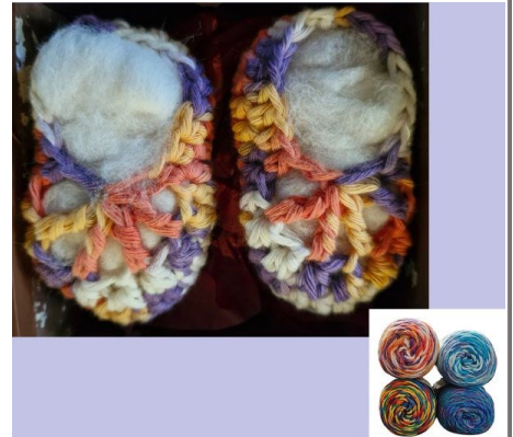
Booties in Coral Reef Cotton JANE F