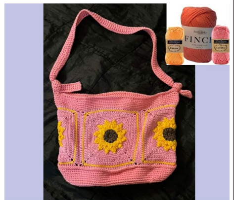
Sunflower Blooms Bag in Finch & Catona Cotton DEB H