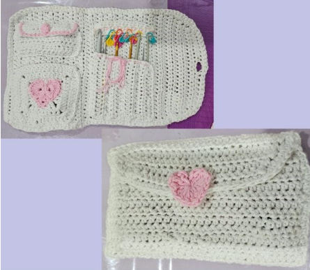
Hook Case in Finch Cotton JEMIMA B