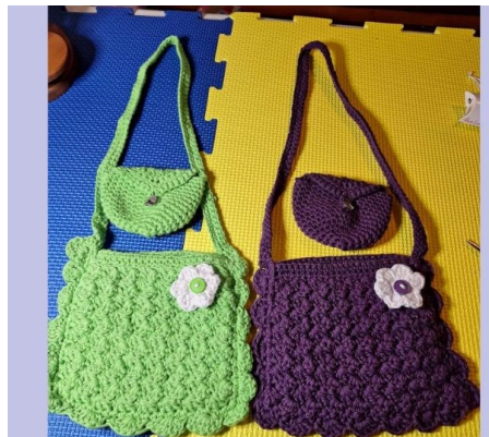
Girls Bag and matching coin purse in Finch CAROLINE G