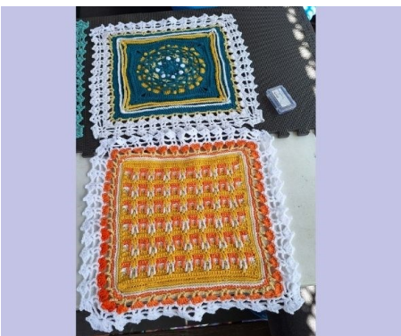
Colour Your World Learn-A-Long Squares turned into Table Centres - Superb 8 CAROLINE G