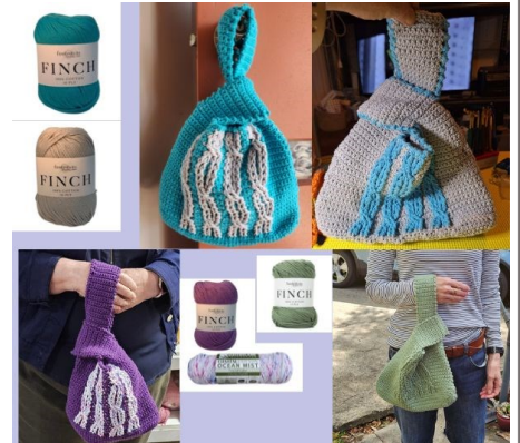
Meandering Vines Japanese Knot bag made with finch (one with Queensland Collection Ocean Mist SEPTEMBER CLASS