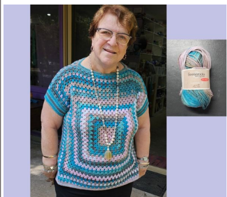
Granny Square top in the Superb Prints acrylic FRAN D