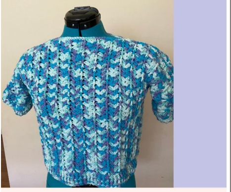
Top made with Queensland Coastal Cotton Coral Reef CHRIS G