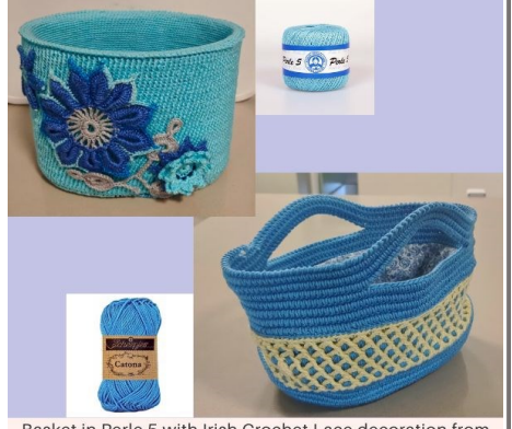
Basket in Perle 5 with Irish Crochet Lace decoration from the 2022 Crochet Retreat. Bag in catona around parachord FRANCIS L