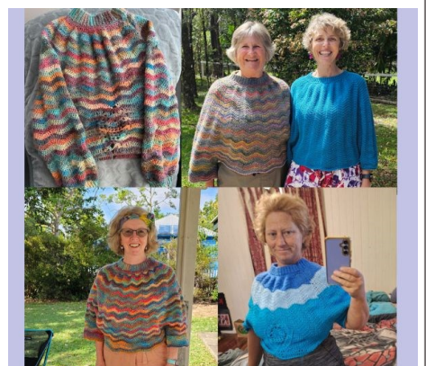
Swoncho made using Sierra, Superb 8 and Bellissimo Lucca JULY SWONCHO CLASS