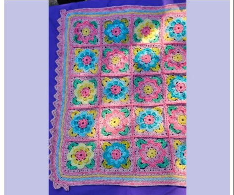
Baby blanket with flower motifs made with Stone Washed and Marble LEANNE W