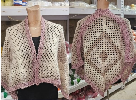
Shawl - own design - with Marble cotton/acrylic SUE T