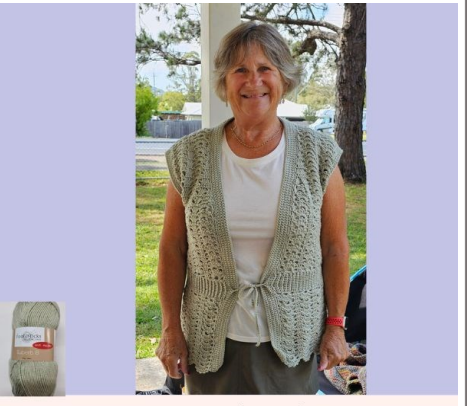
Vest in Superb 8 acrylic DE'ARNE G