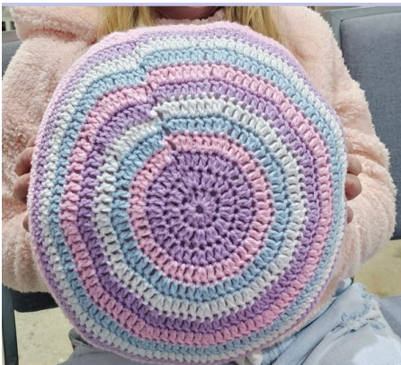
Cushion in Finch Cotton JEMIMA B