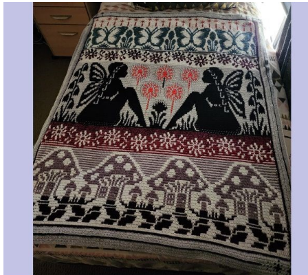
Fairydust Blanket made using whirl & scraps SUE P