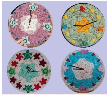
Catalina Waves in Time, wall Clock in Finch Catona & Wren - with some variations OCTOBER CLASS