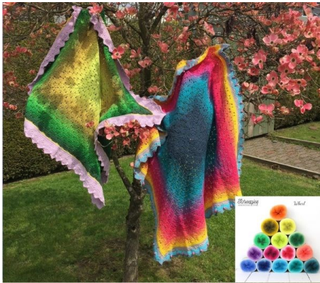
Banksia Baby Rug in a Whirl cotton/acrylic FIONA P