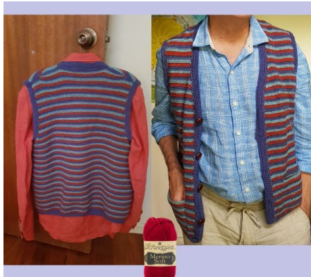
Vintage crochet striped waist coat using Merino Soft MAUREEN K