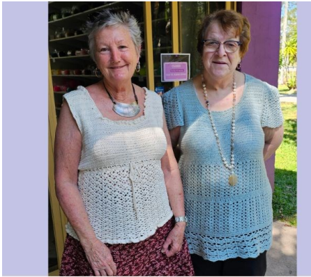
Coastal Breeze Summer tops in Catona cotton SUE & FRAN