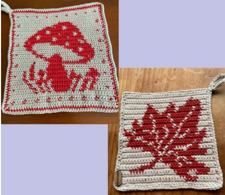
Tapestry Potholders in Catona & Finch cotton - pattern by Raffaella SUSAN G